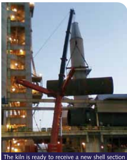
The kiln is ready to receive a new shell section

This simple procedure, when carried out completely and properly, will yield the desired result of a once again straight kiln.