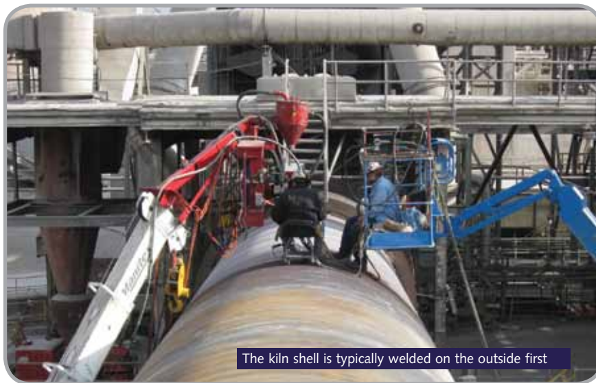
The kiln shell is typically welded on the outside first

Kilns are at the heart of a cement plant – without a kiln there is no cement. A topic that frequently arises is kiln reliability. However, a part often overlooked is the kiln shell. Key questions in ensuring the ongoing stability of the shell include: "When is it time to replace the shell?", "How much new shell is required?" and "Where does it need to be replaced?"