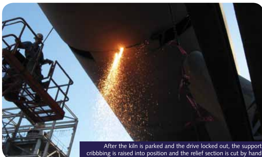
After the kiln is parked and the drive locked out, the support cribbing is raised into position and the relief section is cut by hand